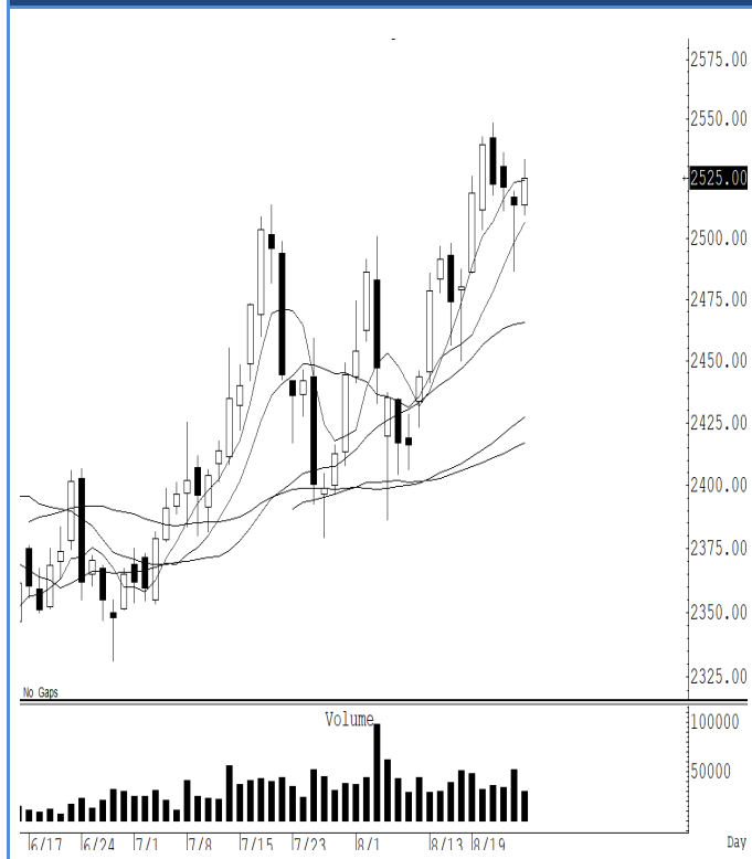
GOU24 (Close 2,525.0 Chg 11.10)

ราคาทองคำโลกเริ่มฟื้นตัวขึ้นมา เราแนะนำยกการ์ดสูงหรือตั้ง stop ไว จากความผันผวนของราคาที่เราคาดว่าจะแกว่งแรง แนะนำ trading ในกรอบ 2,505-2,540 ดอลลาร์ ระวังกำไร ในกรณีที่ปิดต่ำกว่าระดับ 2,450 ดอลลาร์ แนะนำ ถือ short หวังผลปรับตัวลงไปแถว ๆ 2,390 ดอลลาร์ ระวังกำไร